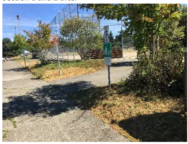
Section 3 along parking lot sidewalk vegetation cut down for CEPTED