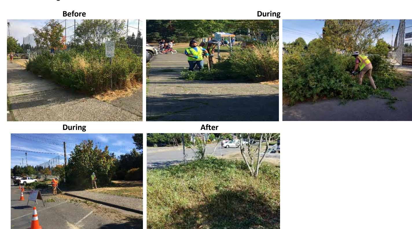
Section 2 along parking lot sidewalk vegetation cut down to 3-4' for CEPTED