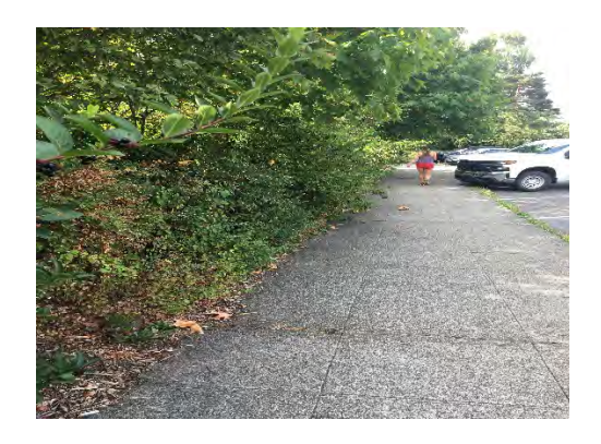
Section 1 along sidewalk and athletic field